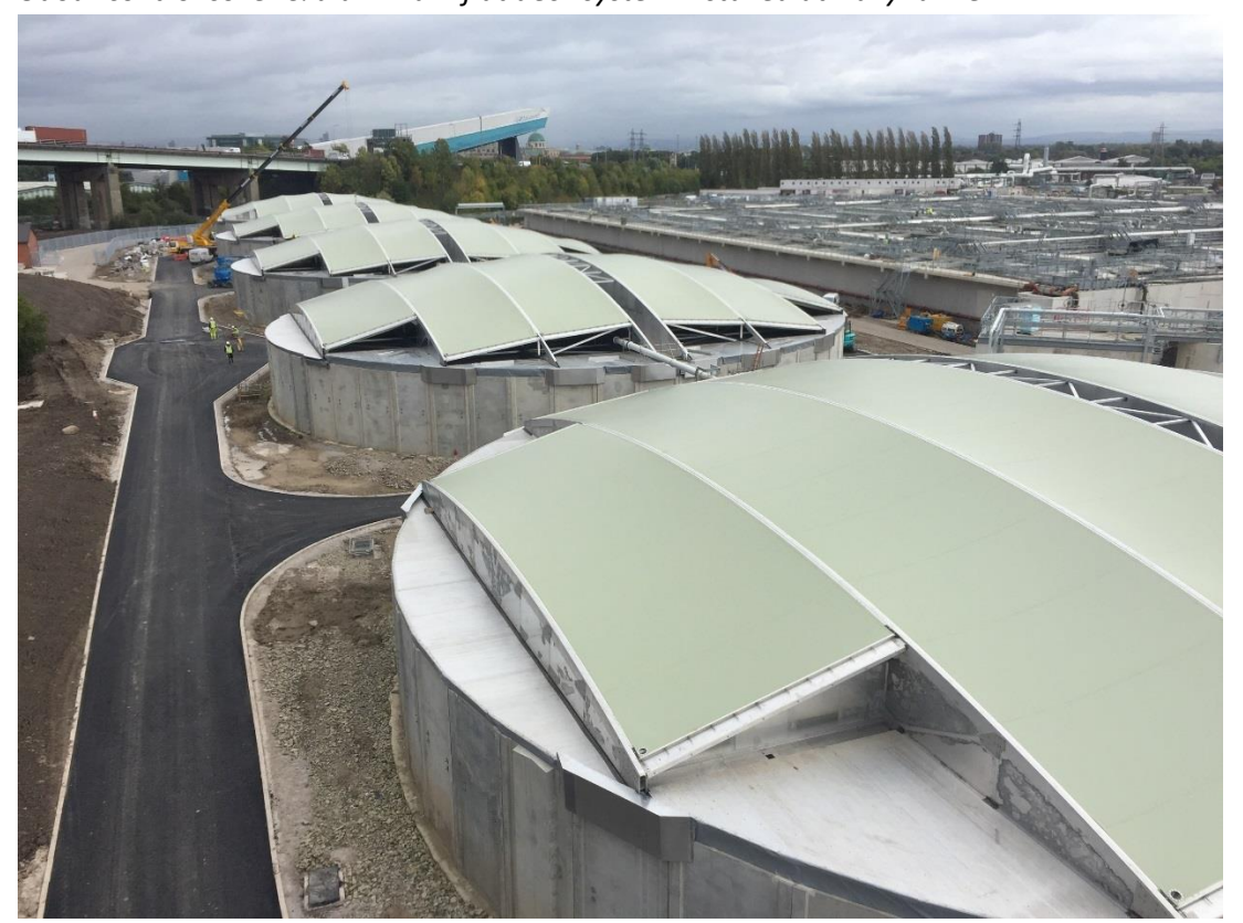
Odour control cover & aluminium flat deck system installed at Davyhulme WWTW