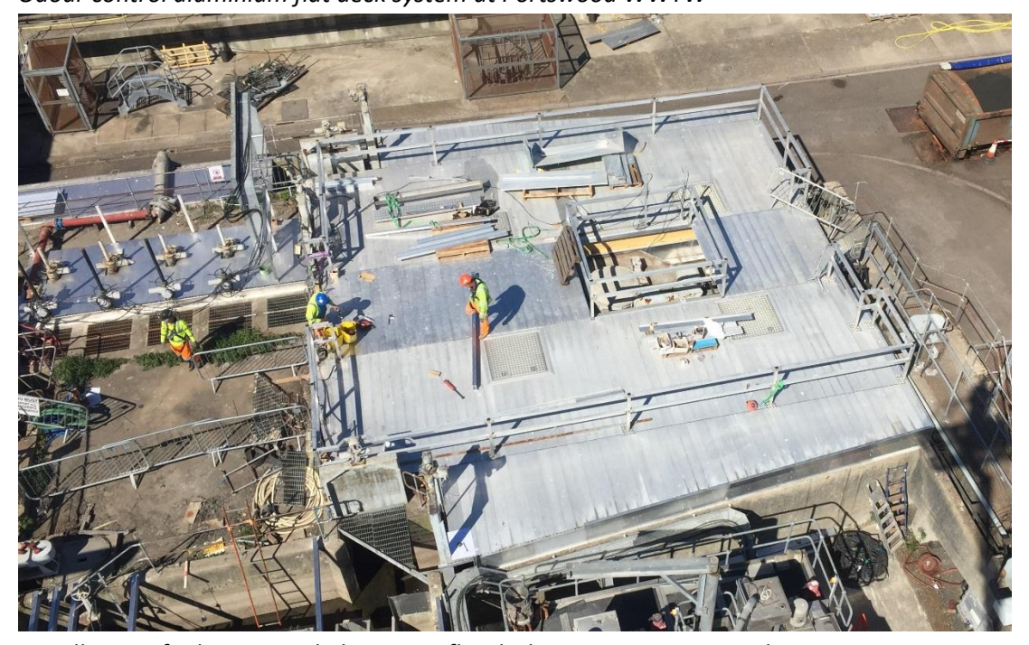
Installation of odour control aluminium flat deck system at Portswood WWTW