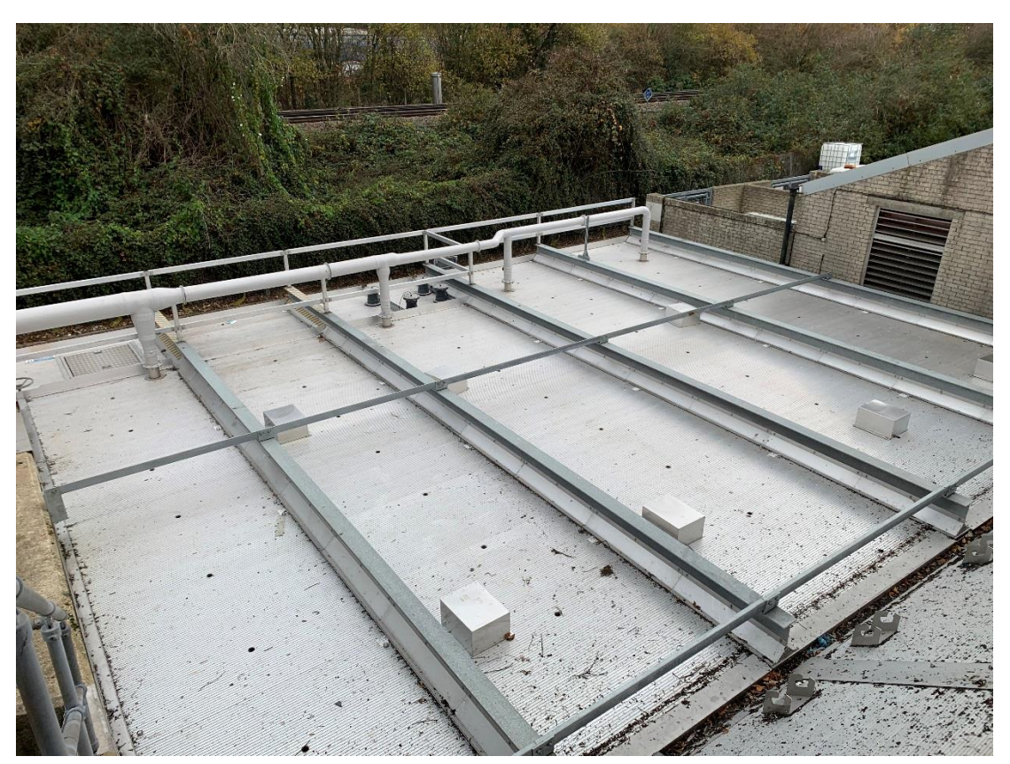
Odour control aluminium flat deck system at Portswood WWTW