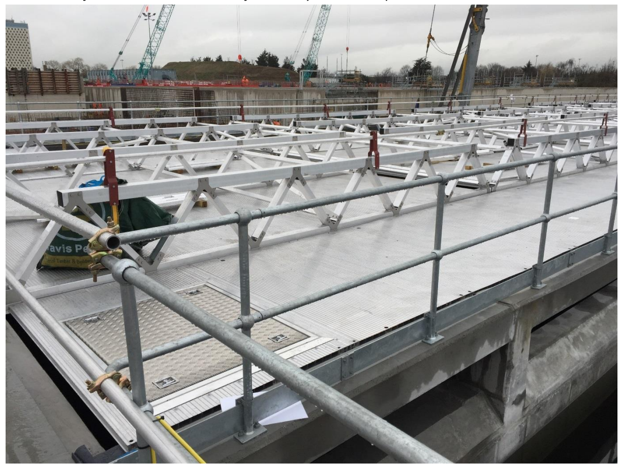
Installation of odour control aluminium flat deck system & access hatch at Deephams STW