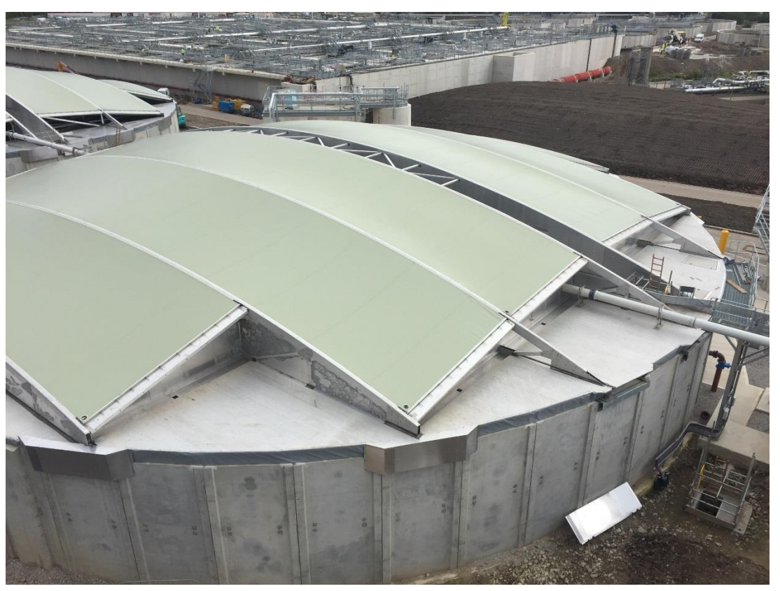
Odour control cover & aluminium flat deck system installed at Davyhulme WWTW